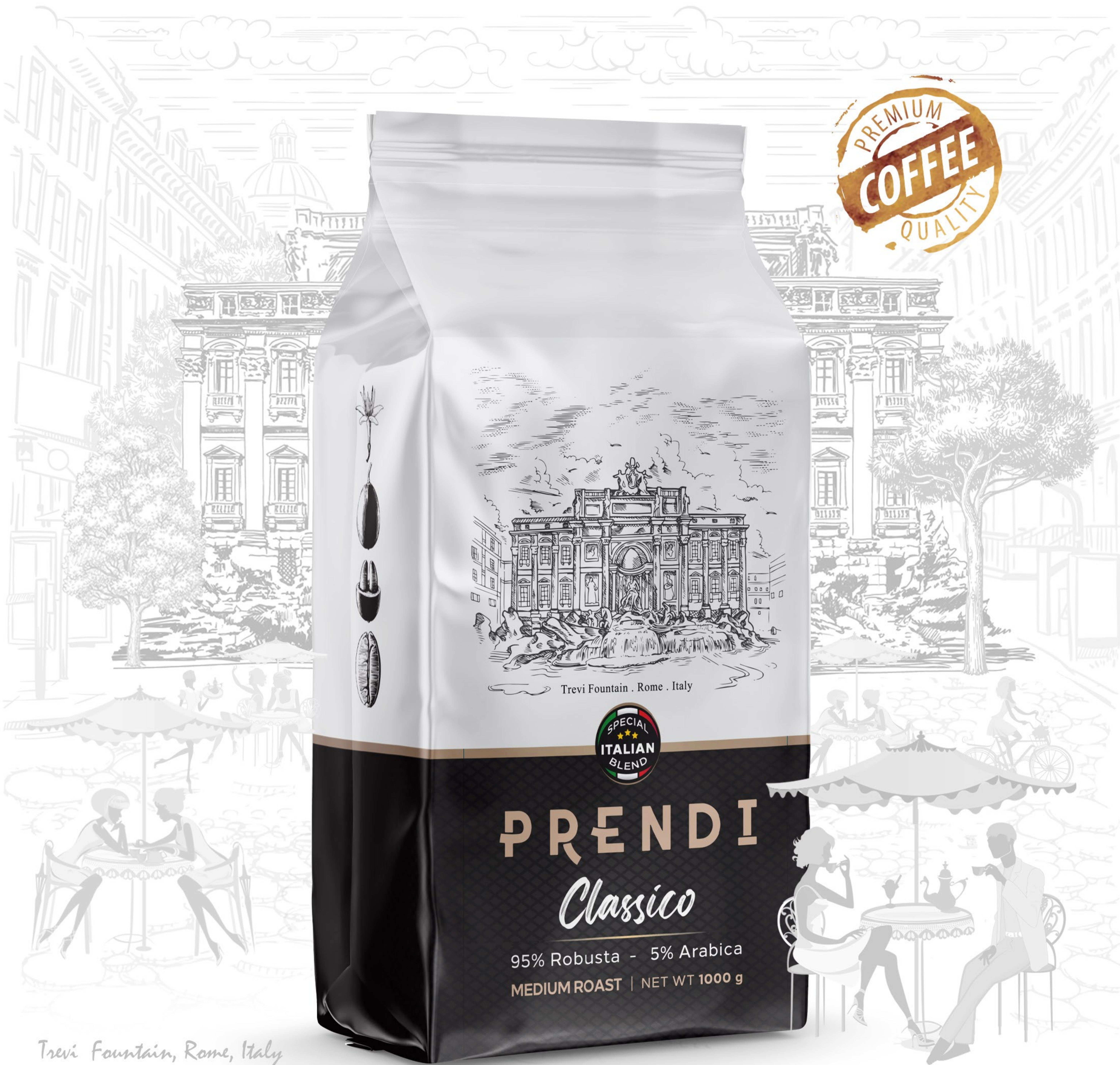
Trevi Fountain, Rome, Italy